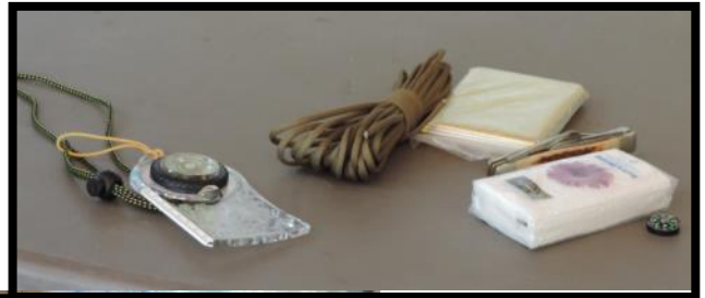
Famous 5 survival items