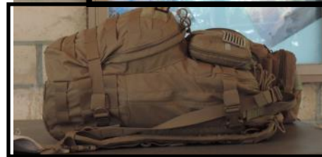
Jerry's trusty backpack