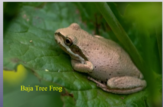
Baja Tree Frog