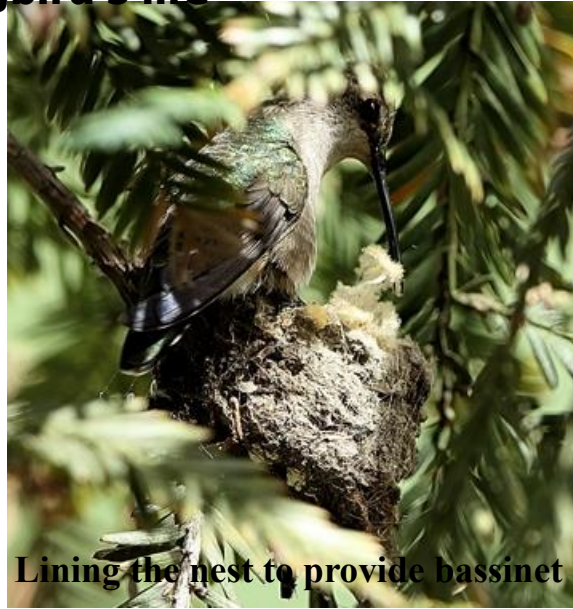
Lining the nest to provide bassinet