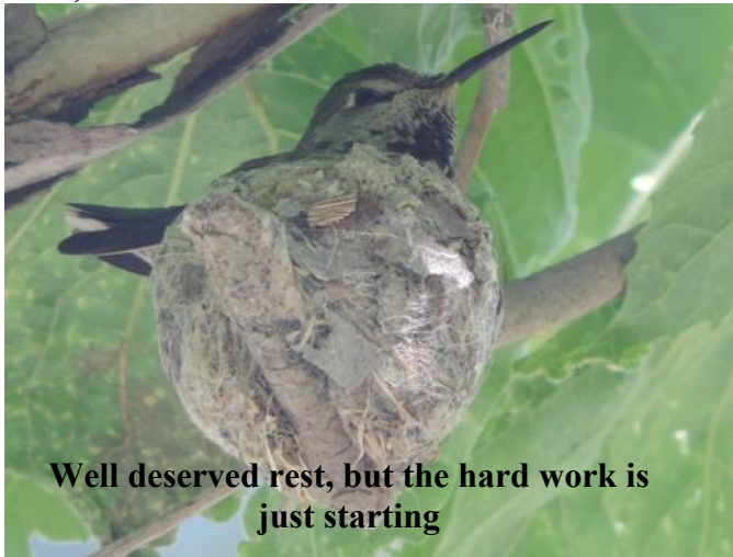
Well deserved rest, but the hard work is just starting