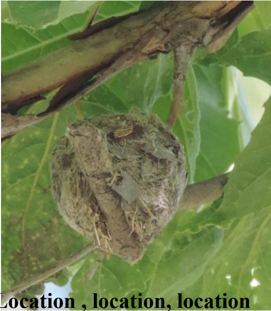
Location , location, location