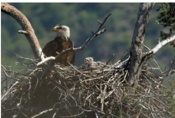
Eagle family for the second year by the San Gabriel Dam. Two chicks this time. Notice the male bringing home the bacon (read unlucky coot)